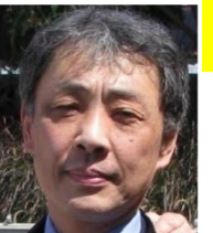
Pr. Shuichi YAMAMOTO ,